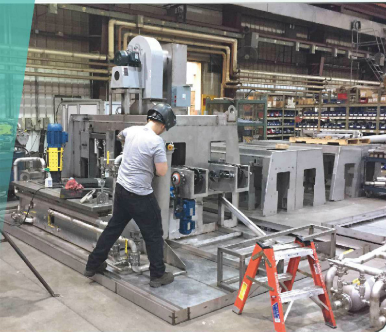
An experienced staff of design engineers, machine operators, welders and assemblers are required to build each of the company's custom cleaning systems.

Once spraying has been completed to remove gross contaminants, the chamber is filled and high-intensity sound waves are introduced into the solution, forming vacuums within the crevasses of the parts being cleaned. Depending on the frequency of the sound waves, contaminants are removed at the lower end of the scale while material can actually be removed from the part surface at higher exposures. Basically, the vacuums collapse or implode, bringing the solution into contact with the surface in a burst of energy that carries contaminants away. Mills says the company has managed to meet cleanliness specifications down to 50 microns.